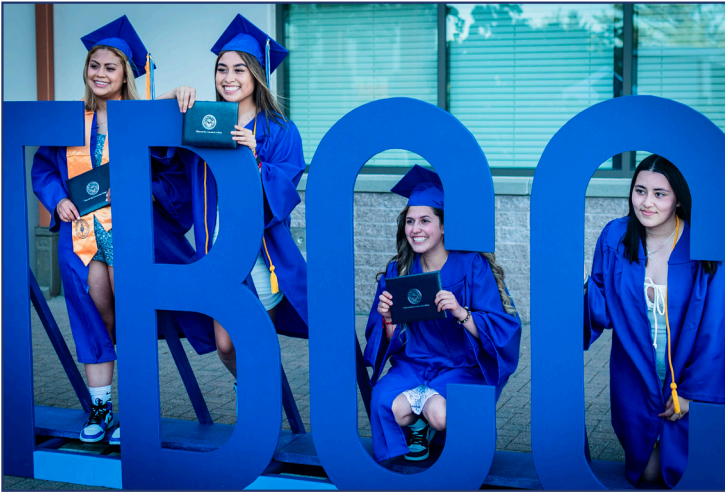
The TBCC graduation commencement was held June 18, 2021 outside on the TBCC main campus. Graduates from both 2020 and 2021 were recognized for their accomplishments. It was the first graduation to be held on campus.

In June, TBCC held its first graduation held on the TBCC campus. It took the generosity and support of many community members and organizations to make it happen.